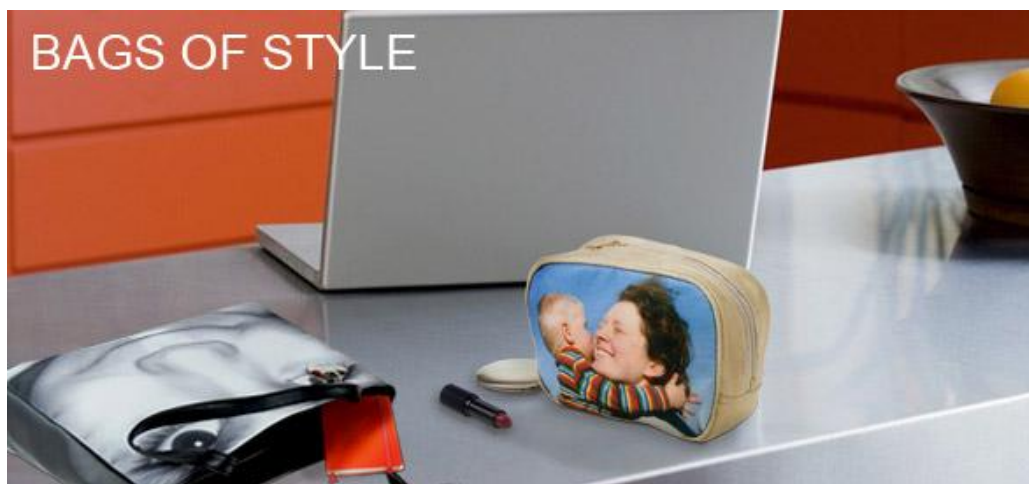
Photo Bag Collection

Create a bag as a gift for a loved one or simply for yourself from our comprehensive range of faux leather, faux suede and canvas Bags. The high quality personalised bags will be a great present for any occasion.