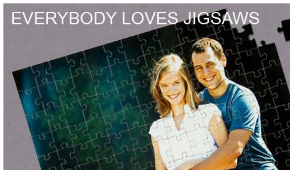
Photo Jigsaw Puzzle

This easy-peasy 60-piece puzzle is suitable for old and young alike, making it great fun for all the family. Choose a picture that means something special to you, or the person you're sending it to. You'll soon be sat round in time honoured tradition playing, 'Can you guess what it is yet?'